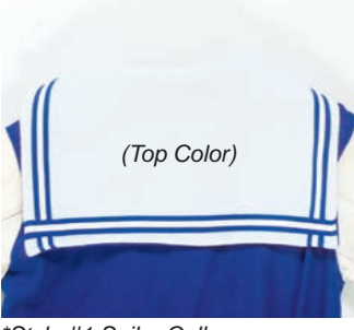
*Style #1 Sailor Collar