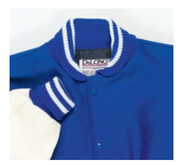
Style #G "Whiting Rolled Style" Single ply rib knit trim with rolled cuffs

White-56 hood and sailor collars are standard using Fleece fabric. Braid is optional in 1 or 2 colors