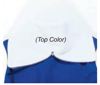
*Style #2 Zip Divided Hood *Style #2B Zip Divided Hood without snaps