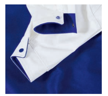
Cuff - Leather, Vinyl, Wool Snap on cuff matches jacket front snap color