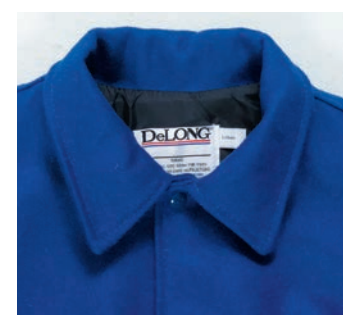
Style #4 Wool Byron Collar-Matching or Contrasting