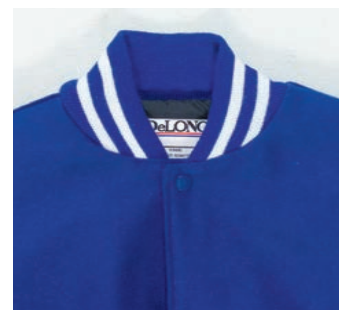
Style #7 Knit Stand-up Collar, no charge, Standard Collar