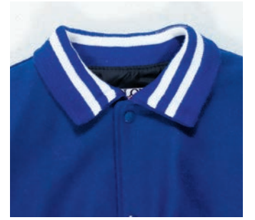
Style #8 Knit Byron Collar