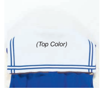
*Style #3 Zip Sailor Collar

Not pictured: Style #H 3 piece Hoodie - 1st color is inside of hood. 2nd color is outside.