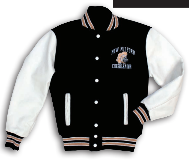
Slim, fitted cut designed specifically for petite women. Set-in sleeves only. Form fitting.